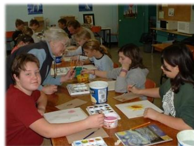
Art Camp over the years