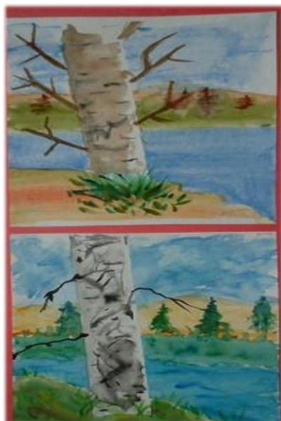
Sample of Art Work

You can also contact Patsy, if you are interested in volunteering or have any questions about the art camp.