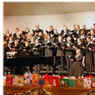
Deer Creek Chorale

Chamber choir selections will range from folk songs, pop songs, spirituals and novelty pieces. As examples, Marty cites "Good Old A Cappella," "Shenandoah," "Loch Lomond," "Ride the Chariot," "Teddy Bear's Picnic," "Can't Buy me Love," "Crazy Little Thing Called Love" and "Lonesome Road."